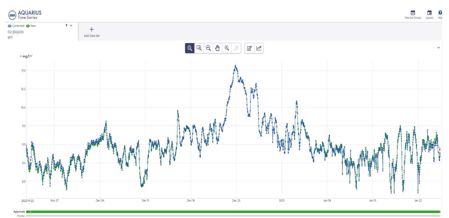
TABLE AI-1: DISSOLVED OXYGEN VALUES IN THE CHICAGO SANITARY AND SHIP CANAL DURING THE PERIOD OF NOVEMBER 23, 2022, THROUGH JANUARY 25, 2023