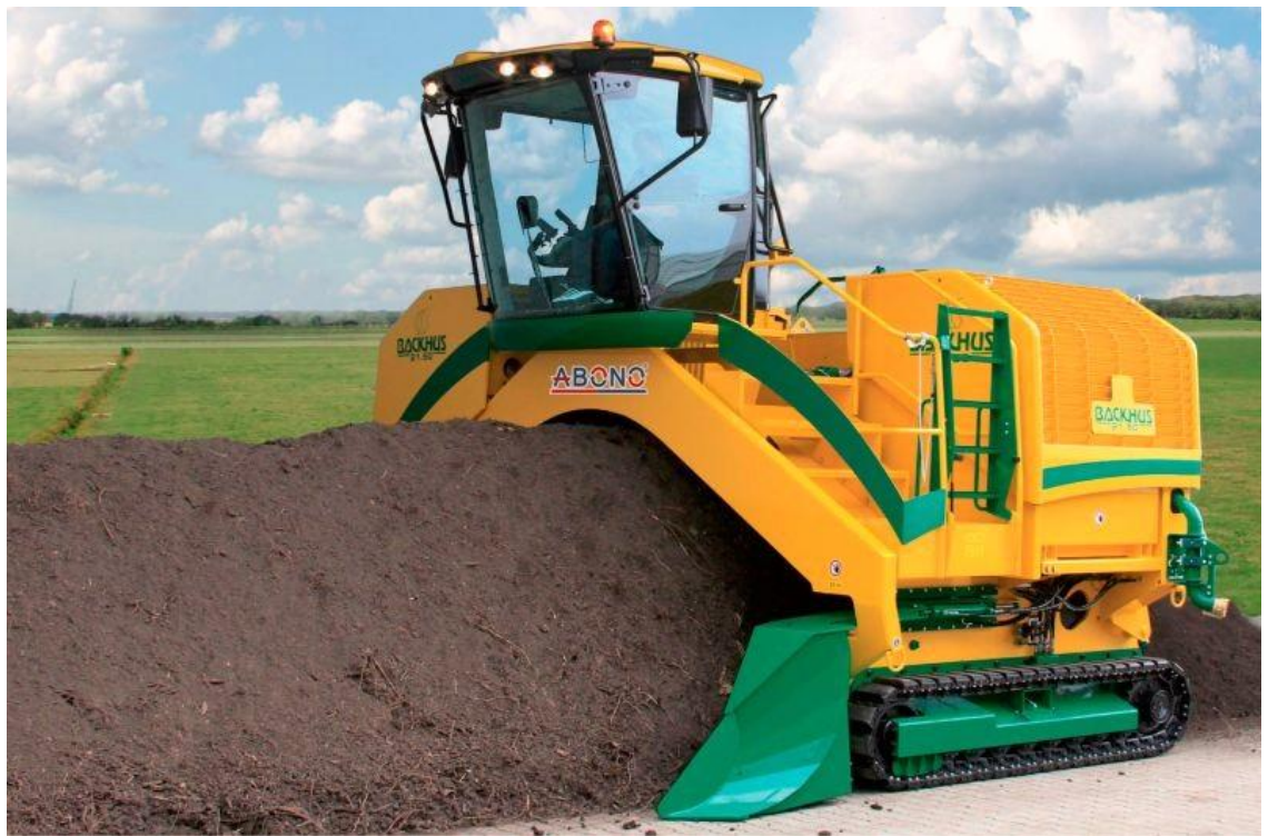
Compost Windrow Turner

The District's planning group in Monitoring and Research has been instrumental in the continual improvement by researching processes for improved efficiency and odor reduction. In addition, by reviewing the activities of the previous year, the District will be able to continually improve its EMS for Biosolids Program in subsequent years.