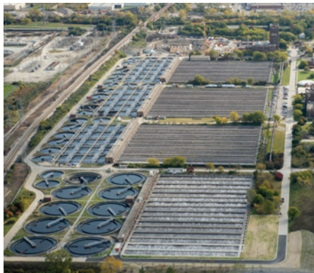
O'Brien Water Reclamation Plant

The Terrence J. O'Brien Water Reclamation Plant (WRP) is one of seven wastewater treatment facilities owned and operated by the Metropolitan Water Reclamation District of Greater Chicago (MWRD). The MWRD is the wastewater treatment and stormwater management agency for the City of Chicago and 125 Cook County communities. We work every day to mitigate flooding and convert wastewater into valuable resources like clean water, phosphorus, biosolids and natural gas.