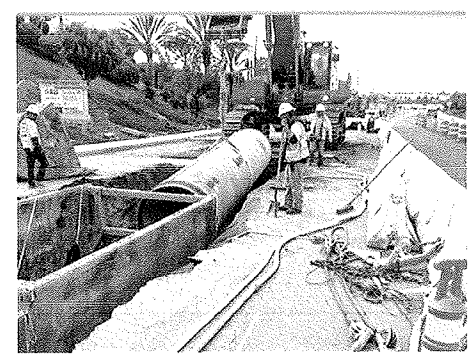
The pipeline is located in Carlsbad, Vista and San Marcos.