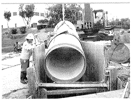
Desalination pipeline connects the desalination plant to the Water Authority's Second Aqueduct.