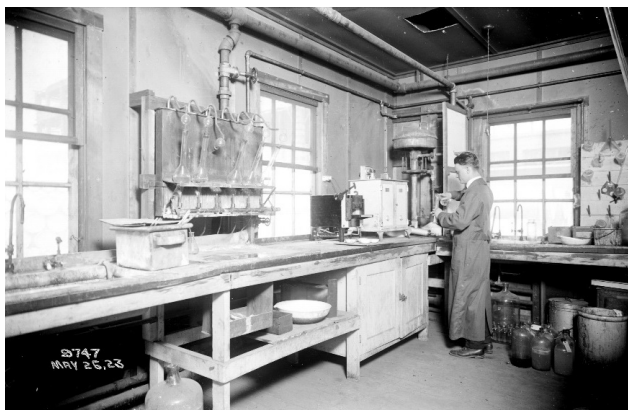
A District scientist tests water quality on May 26, 1923

As the District established the Chicago Area Waterways System (CAWS), water treatment technology was advancing, leading to the creation of treatment plants and interceptor sewers that conveyed water from local collection systems to the plants for treatment. The MWRD constructed 560 miles of intercepting sewers and force mains ranging in size from 6 inches to 27 feet in diameter. The intercepting sewers are fed by approximately 10,000 local sewer system connections, and are critical in managing stormwater and preserving the waterways.