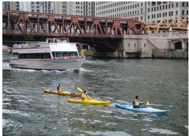
Kayakers paddle on the Main Stem of the Chicago River in downtown Chicago

Improving stormwater management and developing new technology at water reclamation plants has led to cleaner area waterways. The MWRD created a pre-treatment program to control water entering the plant for treatment and now controls what is leaving the plant through new disinfection technologies that include chlorination/dechlorination at Calumet WRP and UV disinfection at the O'Brien WRP. A testament to the improvements in water quality in the CAWS is swimming below the surface. The number of fish species has shown a steady increase following the implementation of the TARP and Sidestream Elevated Pool Aeration stations. The number of fish species found in the CAWS has drastically increased since the 1970s when monitoring of the fish population first began. From 10 known species in 1974, that number has increased to 76, including 59 that have been found in the CAWS since 2000. Decreases in ammonia levels and increases in dissolved oxygen levels have proven to be essential factors for aquatic life, while TARP has also cut the amount of combined sewer