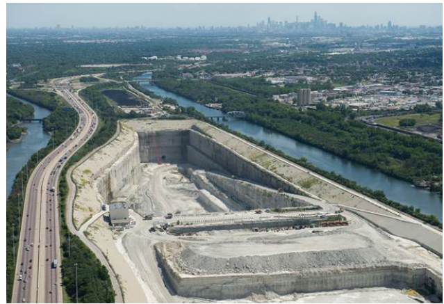
Stage I of McCook Reservoir was unveiled in 2017.

Today, the MWRD treats an average of 1.3 billion gallons of water each day, and the MWRD's total water treatment capacity is over 2 billion gallons per day. The MWRD also controls 76.1 miles of navigable waterways, which are part of the inland waterway system connecting the Great Lakes with the Gulf of Mexico. It also owns and operates 34 stormwater detention reservoirs to provide regional stormwater flood damage reduction.