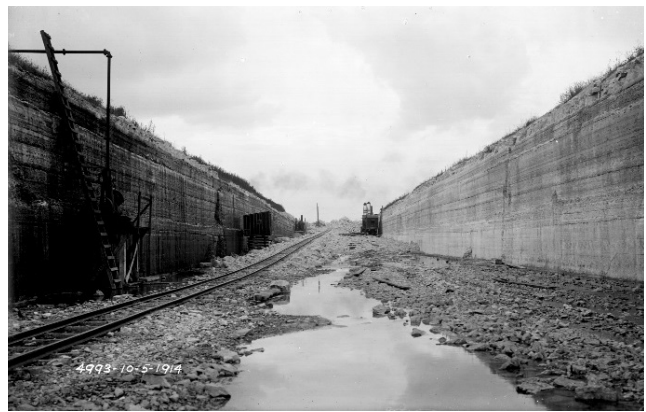
Clockwise, from top left, the Chicago Sanitary and Ship Canal in 1895 and after completion in 1904, followed by the North Shore Channel under construction in 1906 and the Cal-Sag Channel in 1914.

The Enabling Act required a referendum establishing the boundaries of the District, roughly covering 185 square miles from the lakefront west to Harlem Avenue and from Devon Avenue on the north to 87th Street on the south. The District's services were in so much demand that the residents living in the proposed area voted in a landslide 70,958 to 242 in favor of its creation. Today the demand for clean water and the MWRD continues.