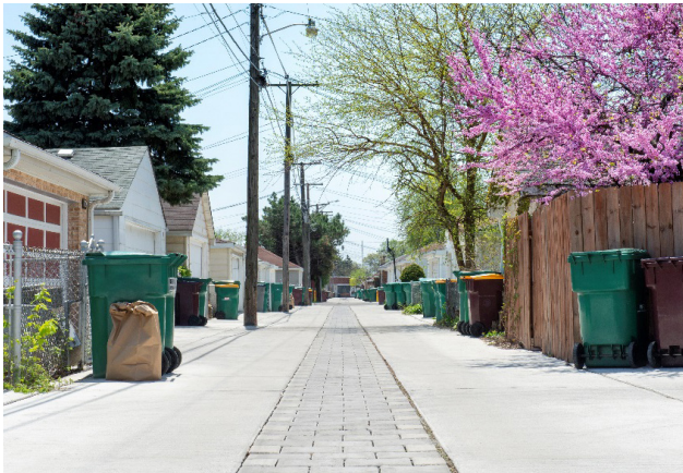
Berwyn green alley

indeed bring the MWRD above ground and into people's homes and businesses unlike the used water treatment from pipes below, it became not only an effort to mitigate flooding but also an opportunity to improve area water quality. The MWRD further put its skills in practice in 2013 when the MWRD Board of Commissioners approved the Cook County Watershed Management Ordinance (WMO). The WMO provides uniform stormwater management regulations for Cook County in order to prevent future commercial, municipal, and residential development and redevelopment projects from exacerbating flooding.