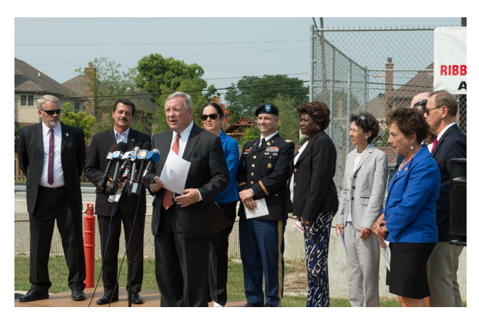
U.S. Sen. Dick Durbin discussed his many visits in the past to the Mount Prospect and Prospect Heights area to view devastating flooding near River Road. The completed Levee 37 project will provide needed protection to those communities.