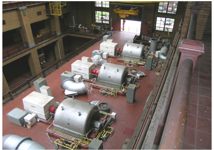
Replacement of the aeration blowers (pictured above) with new blowers will improve plant energy efficiency and reduce maintenance requirements.

The North Side Water Reclamation Plant has been recognized in the past for its outstanding performance in treating wastewater. The District is hard at work to ensure that the exceptional performance of the North Side WRP will continue far into the future.