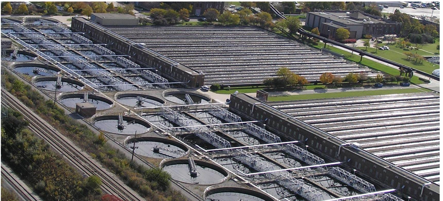
Aeration basins A and B (above right) will receive many improvements including: tank repairs, diffuser and pump replacements, and air and flow distribution improvements. These improvements will enhance treatment and reduce maintenance and energy requirements.