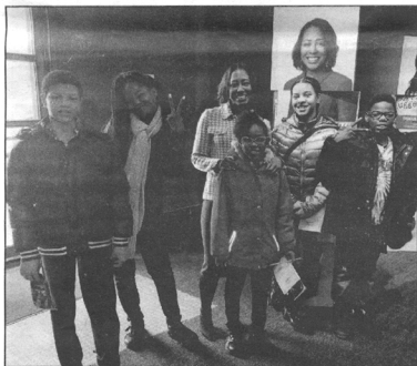
MWRD Commissioner Steele with youth group at MSI.