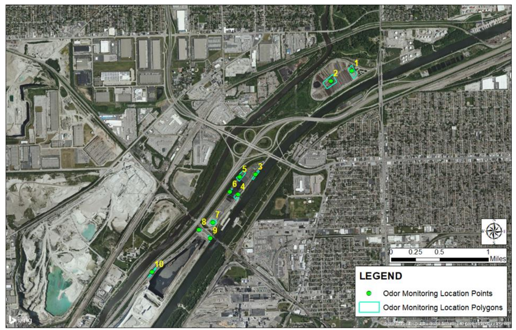
*Locations 1-6 are odor monitoring locations for solids drying areas.

FIGURE AI-2: ODOR MONITORING LOCATIONS IN THE NORTHERN PORTION OF THE HARLEM AVENUE SOLIDS MANAGEMENT AREA, VULCAN, AND MARATHON SOLIDS DRYING AREAS, AND LAWNDALE AVENUE SOLIDS MANAGEMENT AREA SOLIDS PROCESSING SITES*