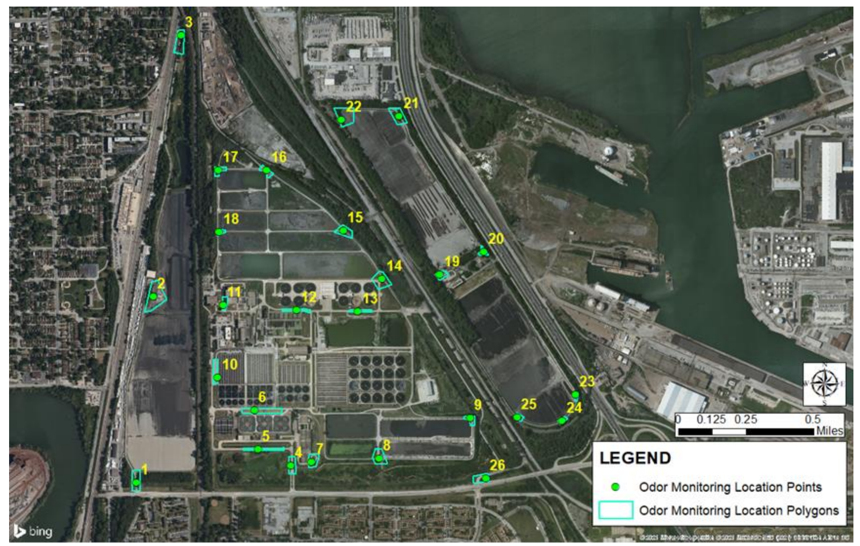
*Location 1–3 and 19–25 are odor monitoring locations for solids drying sites.