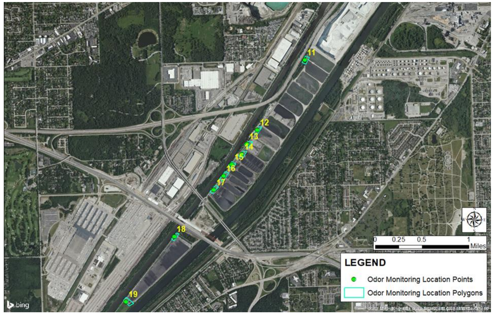
*Locations 11–19 are odor monitoring locations for solids drying areas and solids processing sites.