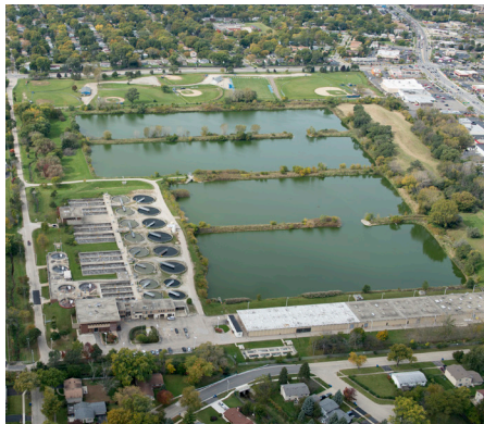
Hanover Park Water Reclamation Plant

The Hanover Park Water Reclamation Plant (WRP) is one of seven wastewater treatment facilities owned and operated by the Metropolitan Water Reclamation District of Greater Chicago (MWRD). The MWRD is the wastewater treatment and stormwater management agency for the City of Chicago and 125 Cook County communities. We work every day to mitigate flooding and convert wastewater into valuable resources like clean water, phosphorus, biosolids and methane.