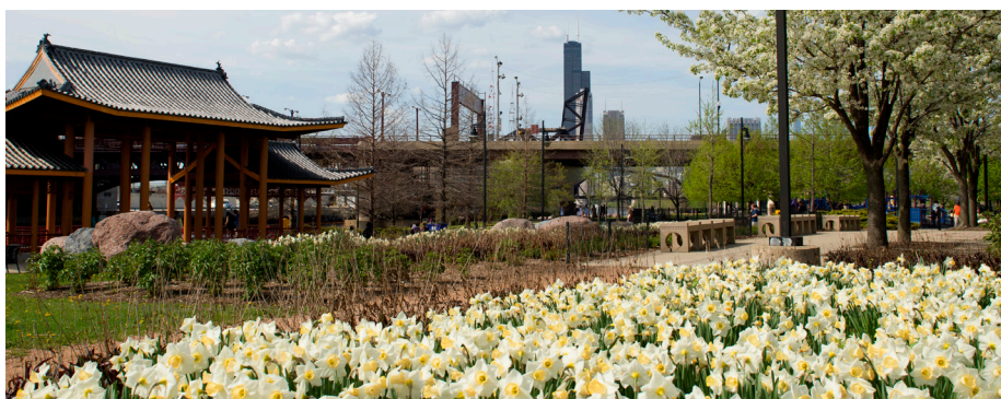
MWRD biosolids, a sustainable alternative to chemical fertilizers, help beautify the Chicago Park District's Ping Tom Park.