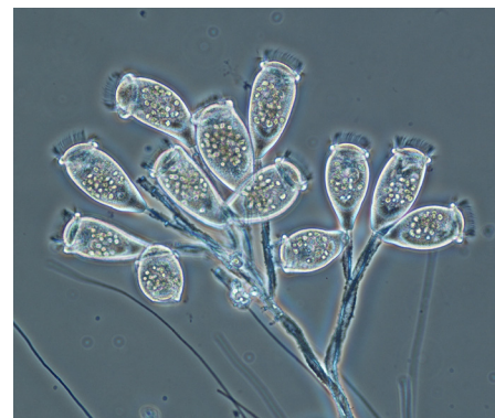
Microbes such as these stalked ciliates help remove bacteria and organic material from the water in secondary treatment.

How do we know we're doing a good job? Wastewater treatment facilities are regulated under the Environmental Protection Agency's National Pollutant Discharge Elimination System (NPDES) permit program. NPDES permits set rigorous standards that the water from the plant must meet. The National Association of Clean Water Agencies has given the Egan WRP the association's highest awards for compliance with these standards. We also see the benefits of our work resulting in increased recreation on the waterways, such as kayaking and canoeing, a rebounding aquatic habitat and increases in fish species. We're reducing energy use at our facilities with a goal of energy neutrality by 2023, and we're recovering valuable resources and expanding the use of biosolids throughout the region.