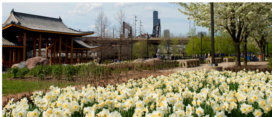
MWRD biosolids, a sustainable alternative to chemical fertilizers, help beautify the Chicago Park District's Ping Tom Park.