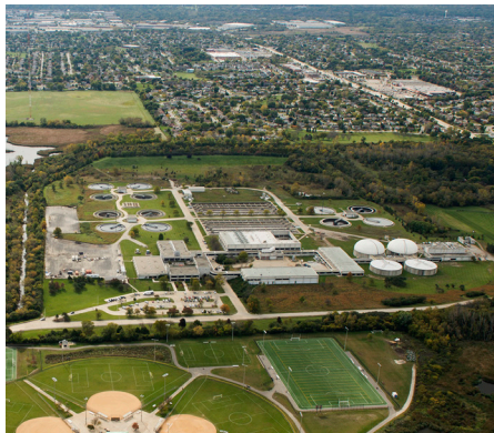
Egan Water Reclamation Plant

The John E. Egan Water Reclamation Plant (WRP) is one of seven wastewater treatment facilities owned and operated by the Metropolitan Water Reclamation District of Greater Chicago (MWRD). The MWRD is the wastewater treatment and stormwater management agency for the City of Chicago and 125 Cook County communities. We work every day to mitigate flooding and convert wastewater into valuable resources like clean water, phosphorus, biosolids and natural gas.