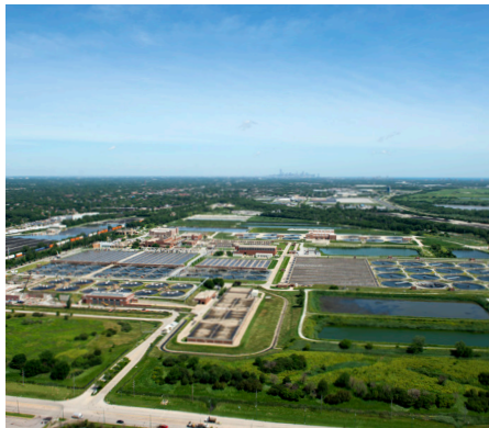
A view of Calumet WRP, looking north toward downtown Chicago

The Calumet Water Reclamation Plant (WRP) is one of seven wastewater treatment facilities owned and operated by the Metropolitan Water Reclamation District of Greater Chicago (MWRD). The MWRD is the wastewater treatment and stormwater management agency for the City of Chicago and 125 Cook County communities. We work every day to mitigate flooding and convert wastewater into valuable resources like clean water, phosphorus, biosolids and natural gas.