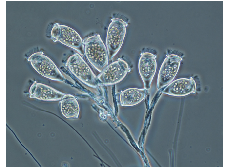
Microbes such as these stalked ciliates help remove bacteria and organic material from the water in secondary treatment.

How do we know we're doing a good job? Wastewater treatment facilities are regulated under the Environmental Protection Agency's National Pollutant Discharge Elimination System (NPDES) permit program. NPDES permits set rigorous standards that the water from the plant must meet. The National Association of Clean Water Agencies has given the Calumet WRP the association's highest awards for compliance with these standards. We also see the benefits of our work resulting in increased recreation on the waterways, such as kayaking and canoeing, a rebounding aquatic habitat and increases in fish species. We're reducing energy use at our facilities with a goal of energy neutrality by 2023, and we're recovering valuable resources and expanding the use of biosolids throughout the region.