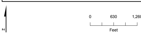
Figure 3.19.1 Tributary Overview: Lucas Diversion Ditch Calumet-Sag Channel Detailed Watershed Plan