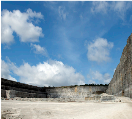
The 7.9 billion gallon Thornton Reservoir, part of the Calumet TARP system.

The Tunnel and Reservoir Plan (TARP), also known as “Deep Tunnel,” is a system of deep, large diameter tunnels and vast reservoirs designed to reduce flooding, improve water quality in Chicago area waterways and protect Lake Michigan from pollution caused by sewer overflows. TARP captures and stores combined stormwater and sewage that would otherwise overflow from sewers into waterways in rainy weather. This stored water is pumped from TARP to water reclamation plants (WRPs) to be cleaned before being released to waterways. The four TARP tunnel systems are designed to flow to three huge reservoirs, and the system will have a capacity of 20.55 billion gallons when complete. That is 5,480 gallons for each person in its service area. One of the largest civil engineering projects on earth, TARP has been extremely effective and widely emulated since the initial tunnels went online in 1981.