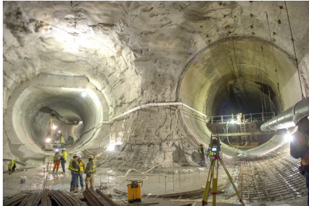
Construction at the confluence of the McCook Reservoir Connecting Tunnel (left) and Mainstream Tunnel (right)

The smallest of the TARP reservoirs, Gloria Alitto Majewski Reservoir was completed in 1998. Thornton Reservoir was completed in 2015 and yielded nearly instant benefits. The first stage of McCook Reservoir is