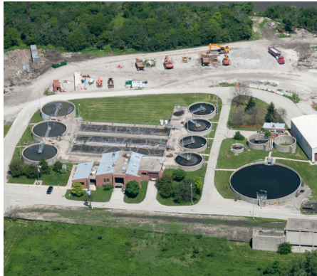
Lemont Water Reclamation Plant

The Lemont Water Reclamation Plant (WRP) is one of seven wastewater treatment facilities owned and operated by the Metropolitan Water Reclamation District of Greater Chicago (MWRD). The MWRD is the wastewater treatment and stormwater management agency for the City of Chicago and 125 Cook County communities. We work every day to mitigate flooding and convert wastewater into valuable resources like clean water, phosphorus, biosolids and natural gas.