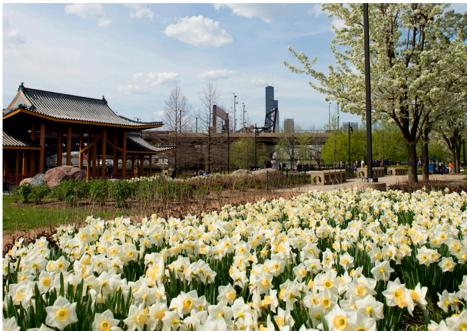
MWRD biosolids, a sustainable alternative to chemical fertilizers, help beautify the Chicago Park District's Ping Tom Park.